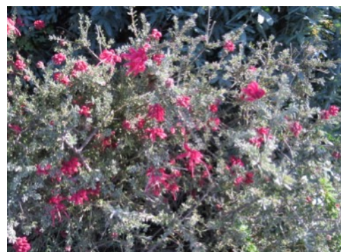
Grevillea Billy Wings

One of the many joys of a native garden is that lots of the plants bloom in winter. But there are also signs now that spring is just around the corner.