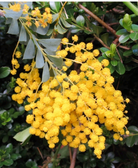
Knife-leaf wattle, Acacia cultriformis

The first day of September is National Wattle Day. And what a great wattle season it is this year, with splashes of gold everywhere.