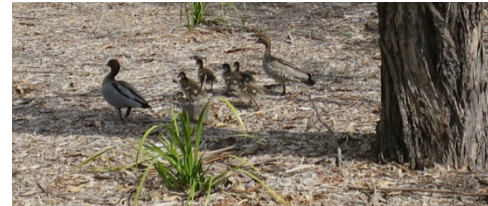
Among other signs of spring, a family of wood ducks was spotted in the park the other day: mum, dad and five ducklings.