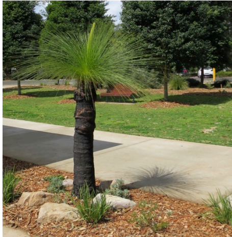
One of the recently planted grasstrees now has a healthy flower spike.