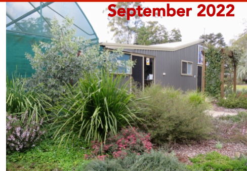
The garden at the nursery is flourishing.